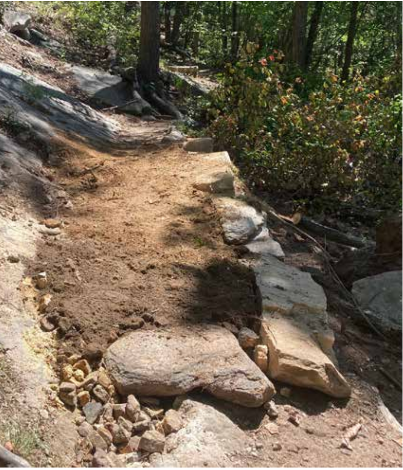
The work required to implement even "simple" improvements is as demanding as it is rewarding.