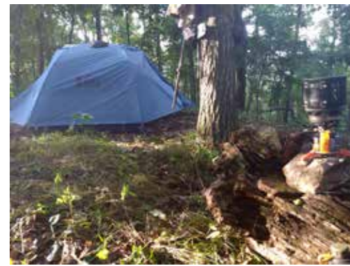
Many AT shelters are surrounded by relatively flat, tent-friendly terrain as here at Fullhardt Knob.

Day two was largely downhill with the notable exception of a short, steep-like-a-pitched-roof climb across a cow pasture just before crossing the Lee Highway. We gained immense respect for the cows that amble up and down that field.