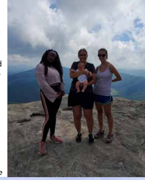
by Jeff Vanke

If you are interested, the easiest way to do the math is described here: https://en.wikipedia.org/ wiki/Earth_bulge