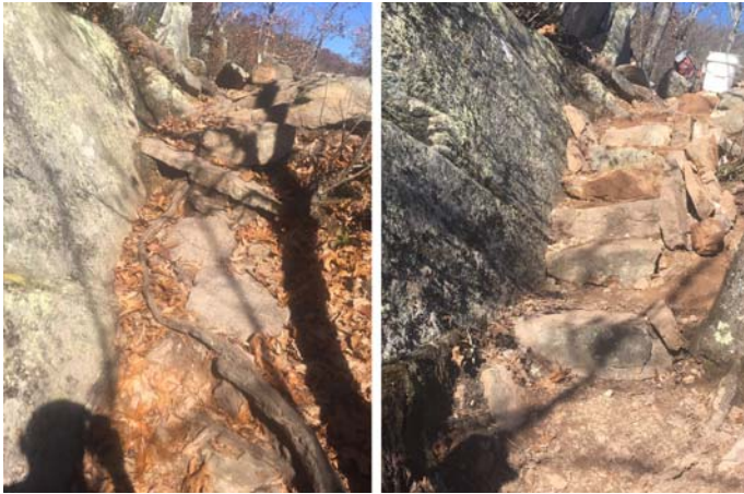
Jim Webb (Leader), Bill Neilan, Mark Farrell, Mike Vaughn, Sandie Myers

It was a cold, windy day when we started out up to Dragon's Tooth. Wind gusts up to 30 mph were forecast for the day. Since the wind was out of the west and we would be working on the south side of the mountain we knew we would be protected. Upon reaching the work site for the day we all got to work digging out the trail for the placement of the new steps, looking for rocks to use as steps, and crushing rocks to use as fill material. Since we are all fairly experienced the work went quickly, without any mishaps. It was a beautiful, sunny day and we enjoyed the view of the surrounding mountains, including the Peaks of Otter, far off in the distance. Surprisingly, no hikers passed us while we were at the work site. We were all tired by the end of the day but were very proud of the seven steps we had installed.