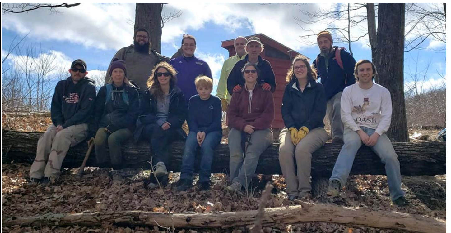
Rockin The Outhouse crew

We had a fantastic crew and everyone immediately jumped to their tasks. By the end of the day, we had dug the hole over 5 feet deep, moved and stained the privy, stained the outside of the shelter and covered the graffiti in the shelter. We also managed to clean up brush around the shelter and cut some firewood. All of this was accomplished before 3 pm, allowing time to either hike up to McAfee Knob or hike out the fire road.