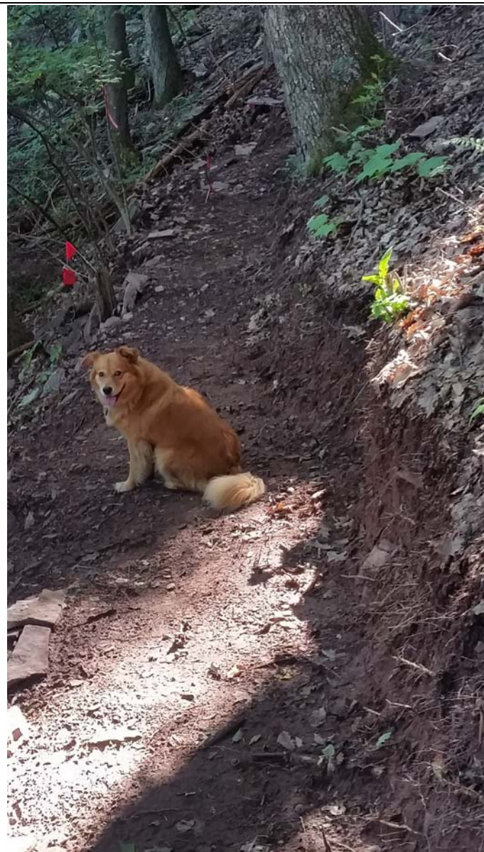
Progress on Sinking Creek Mountain