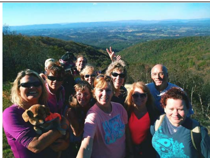
A Cast of Thousands