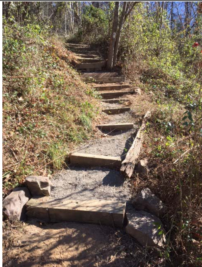
Great Erosion Killers