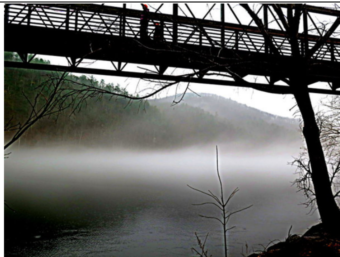
In the fog