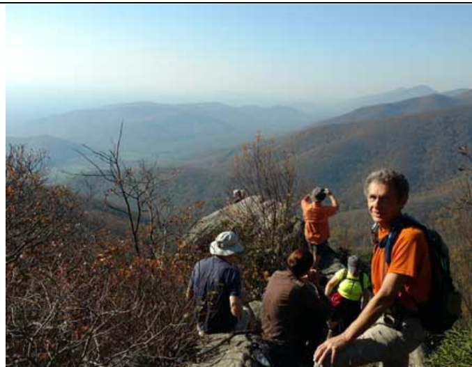
From Terrapin Mountain