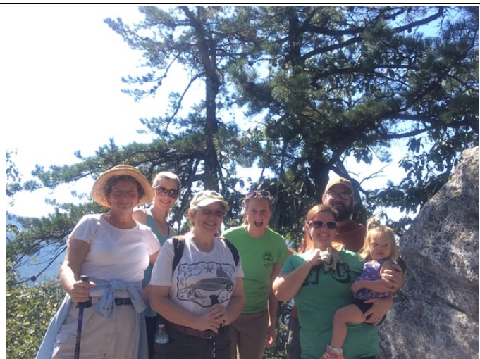
Family Hike on Sawtooth