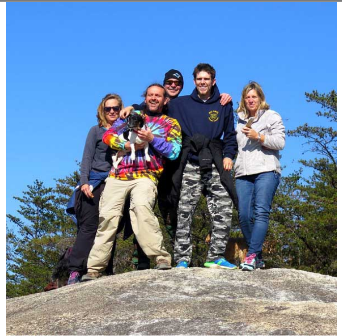
Only serious hikers allowed!