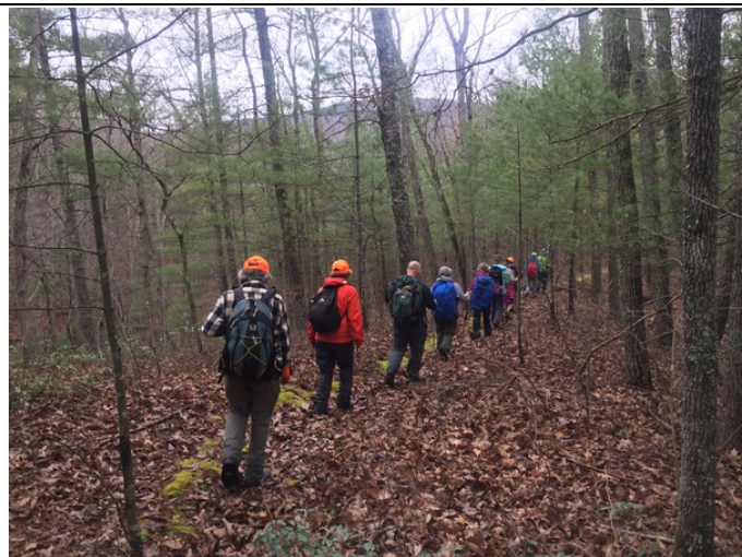
We stayed together