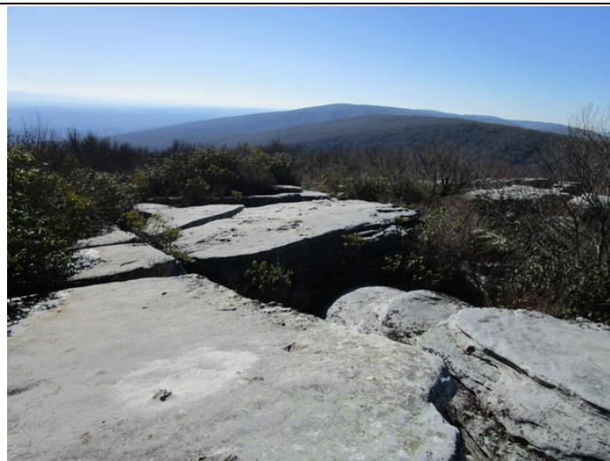
From the Top