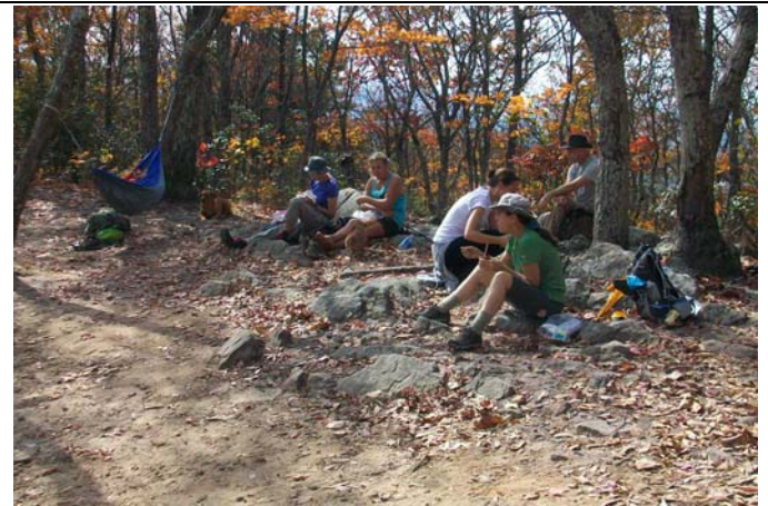
The "Demolition Zone" next to the Tooth Means

advantage and got in a quick siesta, hammock or not ☺ Another great hike with a nice bunch of people.