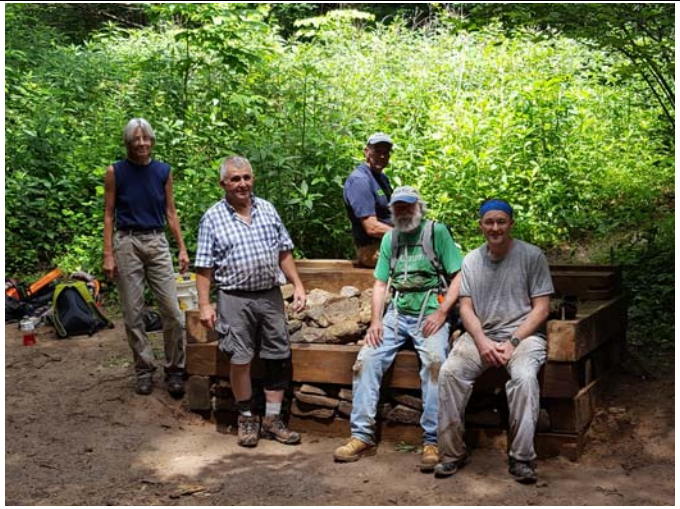
The crew shows off their work