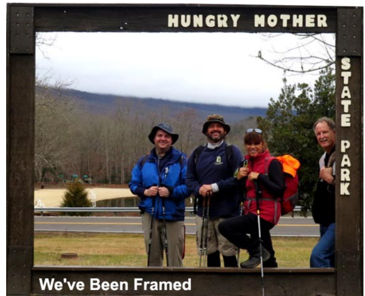
We've Been Framed