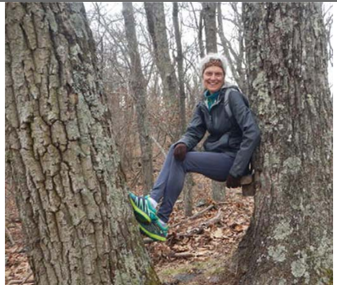
The New Harry Potter Chair