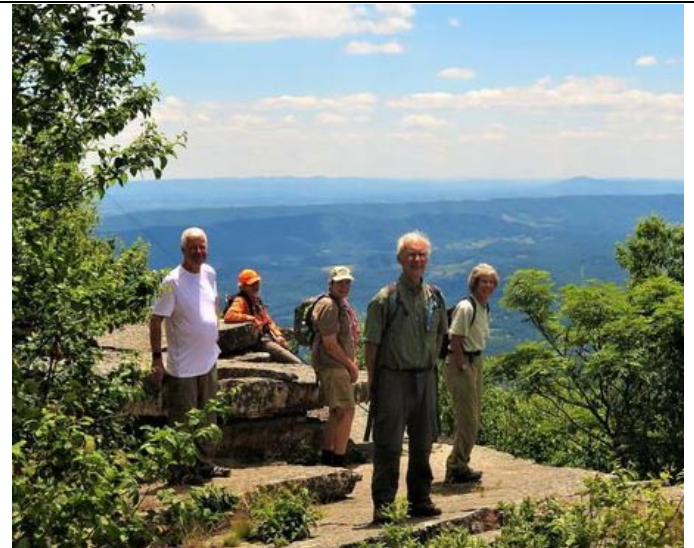
At Barney's Wall

It was a wonderful hike but a bit exhausting. The view at the top was fabulous and so it was worth the effort. We also stopped at Barney's Wall and Cascade Falls on the way to the top. The total mileage was about 12 miles. Some people decided to get ice cream afterward. The weather was bright and sunny.