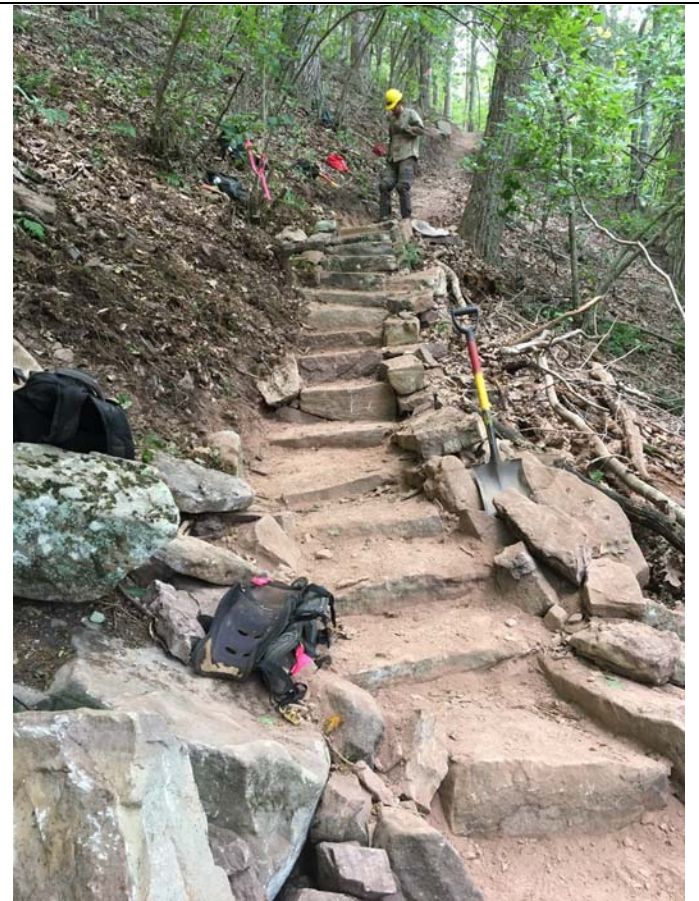
The Stairway to Heaven