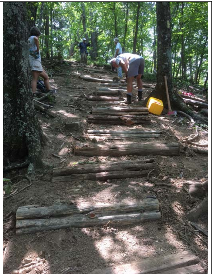
New Steps on the Andy Layne Trail