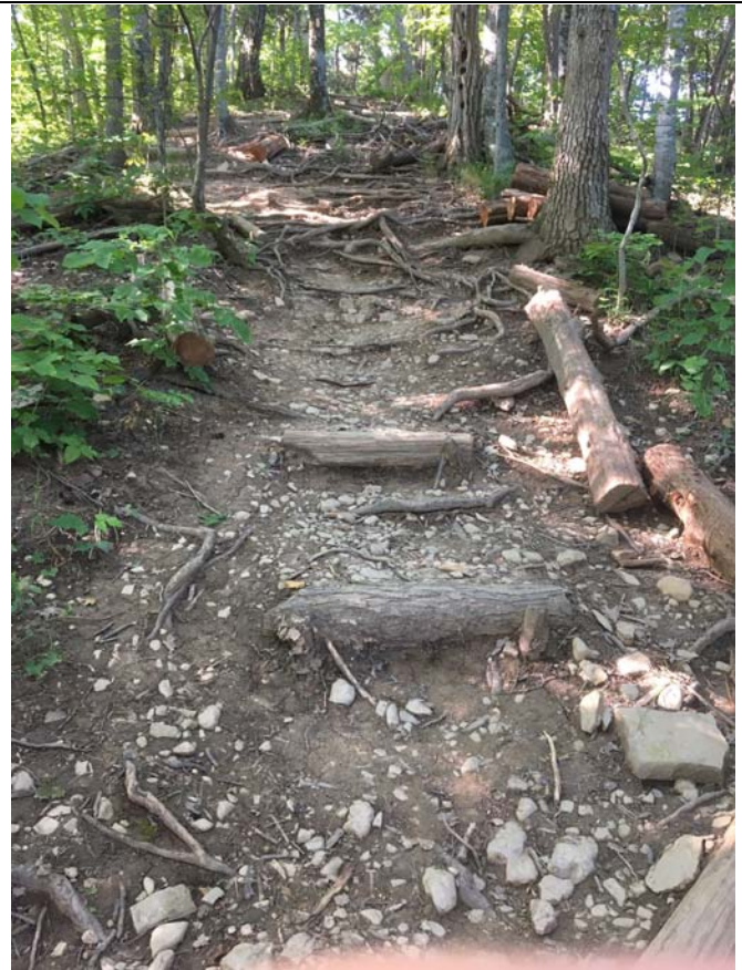
Before (above) and after (below)