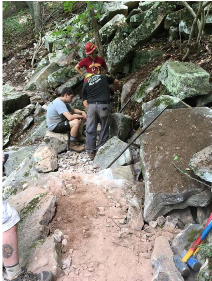
Measuring a Candidate for a Step