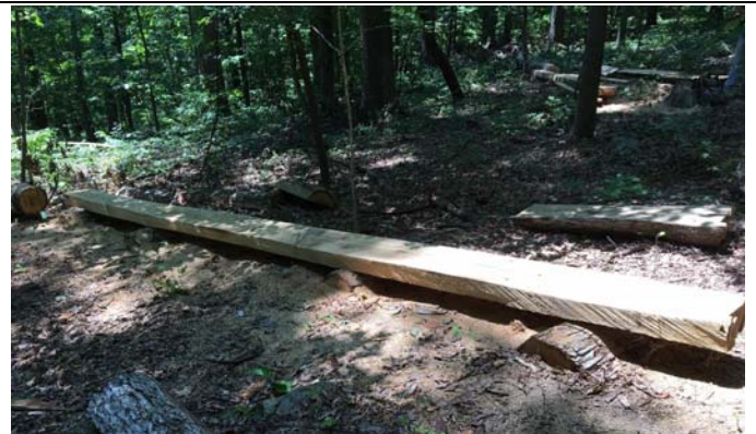
Hand-cut Bridge Beam