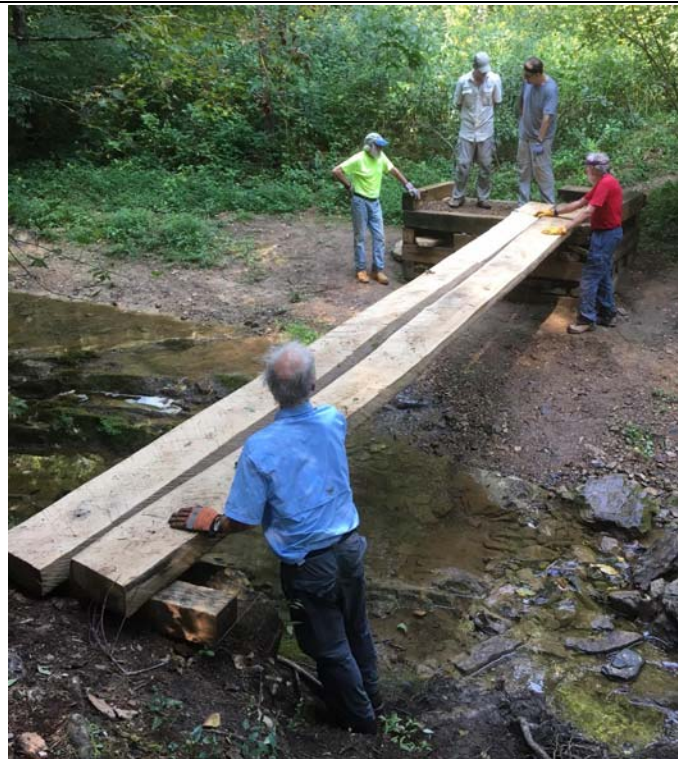
The crew looks over their handywork.