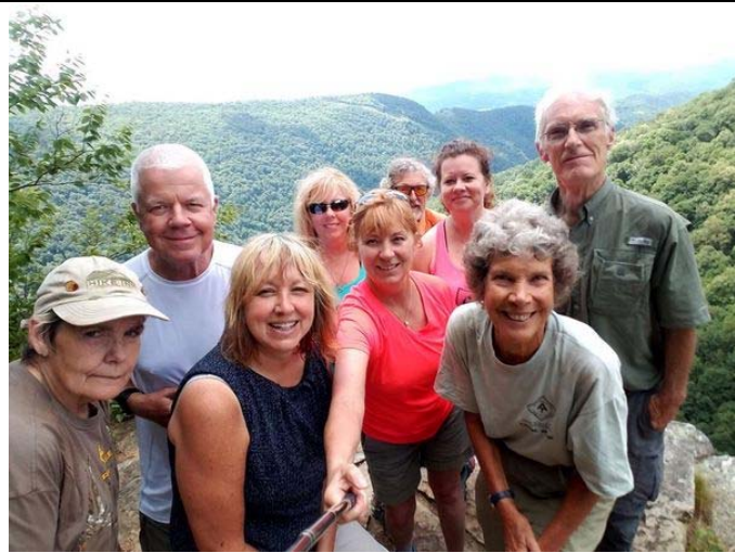
Selfie at the Wall