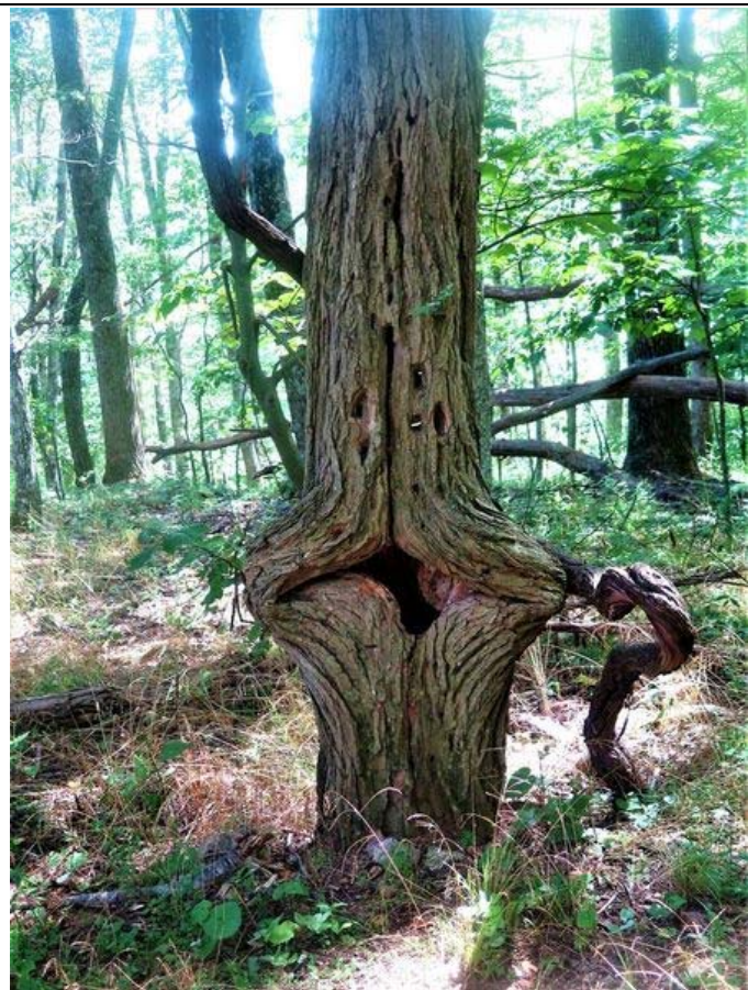
A Happy Tree

After a brief lunch we trekked down the far side of Flat Top and hiked around Abbott Lake back to the Visitors Center. A few members took this opportunity to shuttle back to their cars and regroup, some choosing to end their hike at this spot. The majority went on to climb up Harkening Hill and circle around and visit the Johnson Farm house, totaling 9 miles for the day. An enjoyable hike with some great company, the Peaks area has a lot to offer the day hiker.