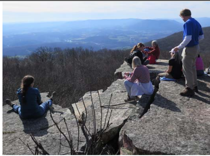
From Butt Mt