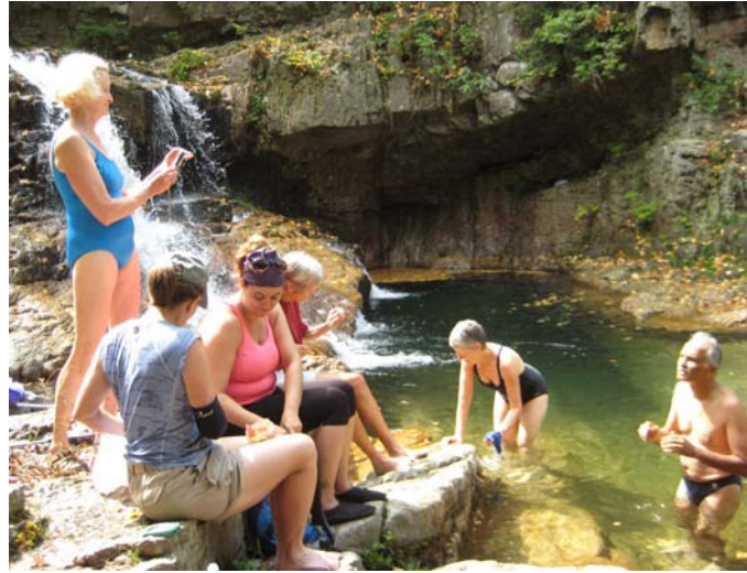
If you think this water is cold, you are right!