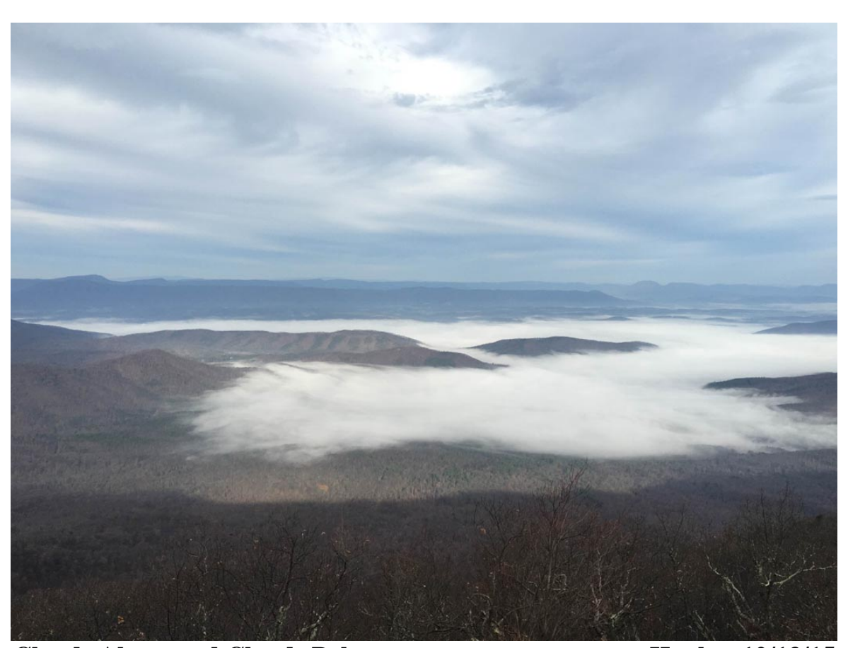
Clouds Above and Clouds Below