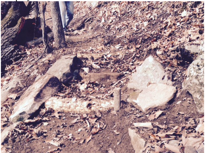
A perfect set of steps, no way to avoid them!

The work hike of 2/9 was moved to 2/10 due to rain. The weather was cool & cloudy. We used large rock and logs to make three steps in a section of trail made steep by erosion.