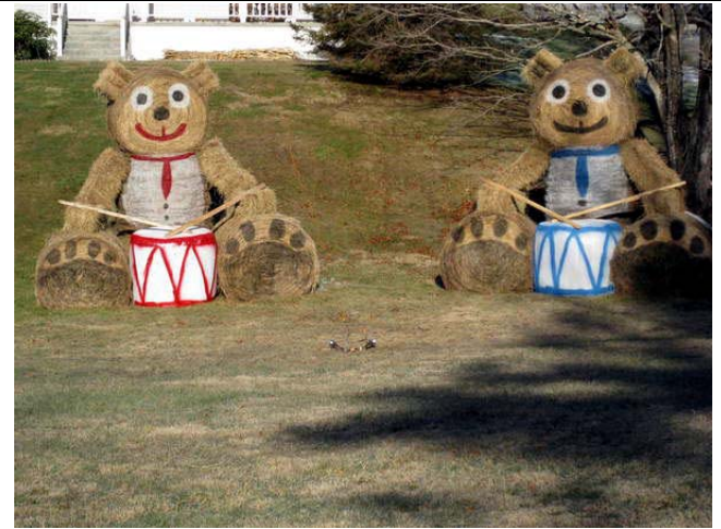
Hay Bale Bears on Route 42 in Bland County between Routes 606 and 611- Dan Dennison

Even though the trail did not offer any magnificent overlooks and no photo opportunities, we did see one outstanding display of hay bale bears playing drums on Route 42 between Route 606 and Route 611.