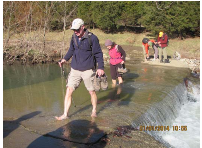
The water was cold! - Cornett

It was an excellent day to be out for a hike. The weather and the company of the fellow hikers were great. The water was cold but the views were outstanding