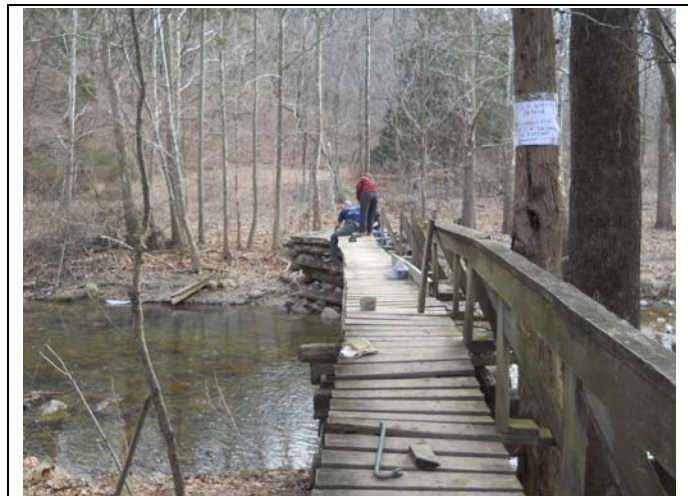
Amazing—Again I express my thanks for these people getting this job done!

On Sunday, February 2, at 10:00 am, I met that same group at the Andy Layne Trail, and by mid afternoon the bridge stringers were back in place. By the middle of the next week I received an email with a picture of the decking and handrails reinstalled.