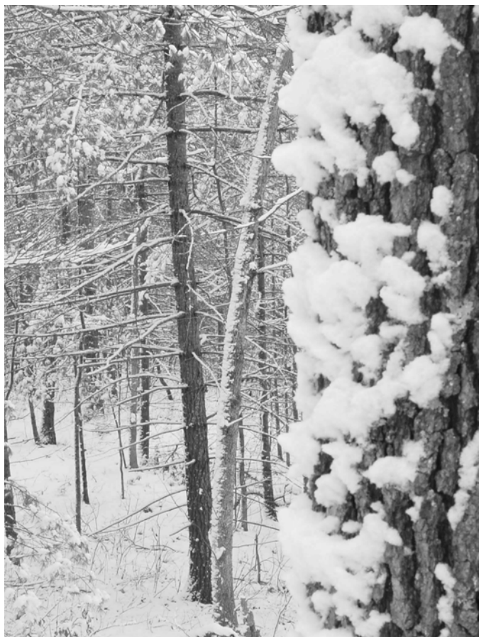
February 12, Buchanan-AT-Horse Tr. Loop

The Roanoke Appalachian Trail Club is a recreational hiking association of volunteers who preserve and improve the Appalachian Trail as the nation's premier, continuous, long-distance footpath.